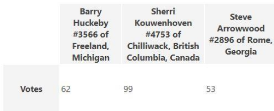
Results for 2020 ATCA Election Board Member -term 2020-2023