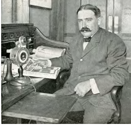
Richard W. Sears