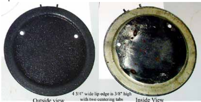
4 3/4" wide lip edge is 3/8" high with two centering tabs Outside view Inside View

Chicago candlestick base plate as pictured. Pressed Steel 4 3/4” wide with two centering pins. The lip is 3/8” high that pins are attached to.