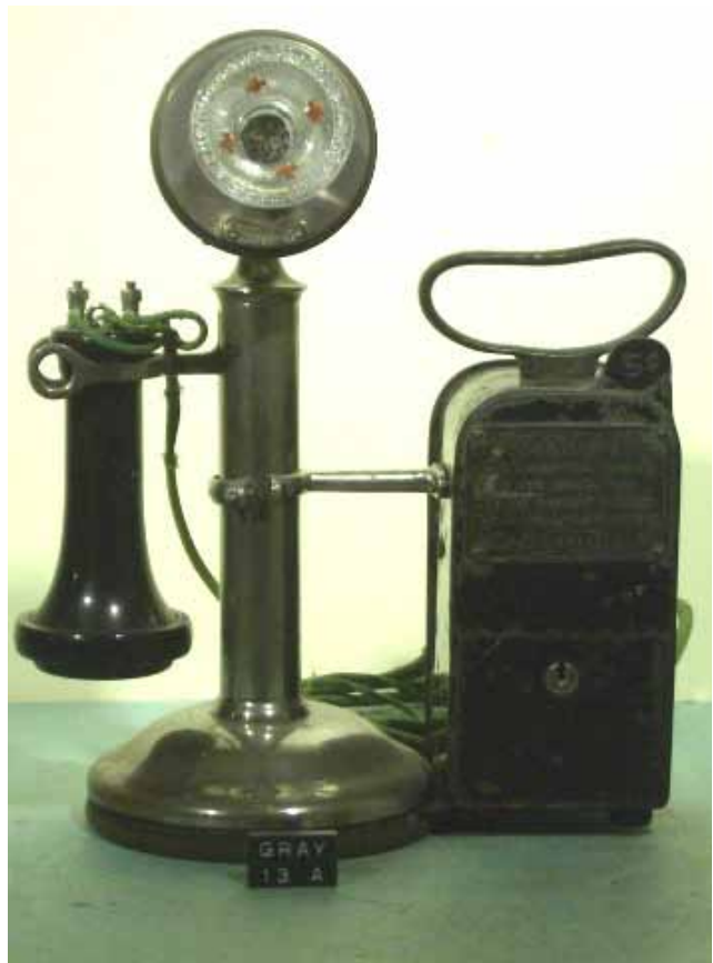
Mike's Vintage Payphone by Mike Davis

This month we are looking at 2 Gray #13As from my collection. One looks to be older, it has a brass tag with the instructions on it. The other one appears to be NOS (New Old Stock). Everything is perfect, the paint, the nickel plating and even the keys. There is no wear on it. This one has screws in it that would mount the instruction plate but unfortunately it is missing. These collectors are very simple, they take a nickel and that's it! When a nickel is dropped in the slot, it strikes a bell. A candlestick phone is attached directly to the collector, the sound of the bell resonates through the bottom plate and arms into the phone so that the sound can be picked up by the transmitter. I would suppose these were used only for making local calls. This model was not made to be mounted to a wall or counter. They are portable. Each one has a carry handle that can be seen in the pictures. They would be used in areas such as restaurants. more photos on page 12