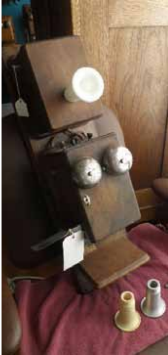
Viaduct sound powered paddle phone before refinishing