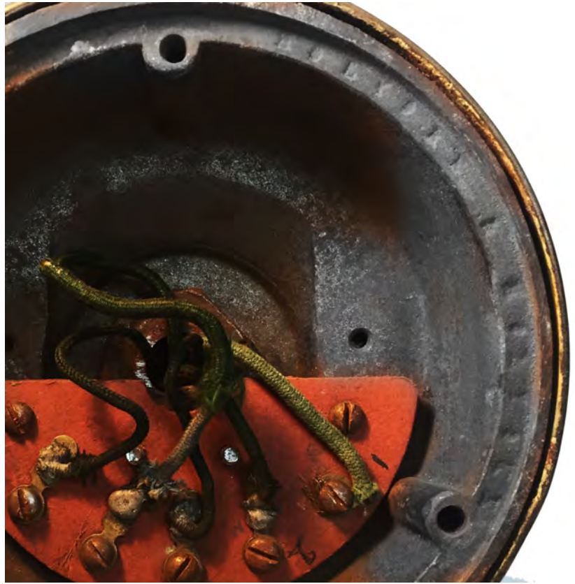
Marked in casting along the edge "Holyoke & Holyoke"