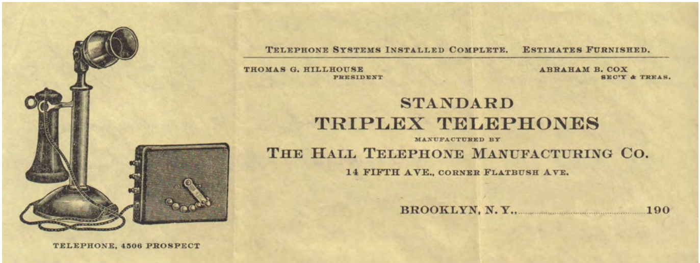
Letterhead showing a Hall candlestick telephone