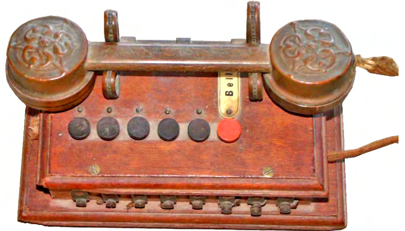
METAPHONE INTERCOMMUNICATING DESK SET.