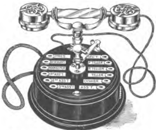
Fig. 2.—Desk Intercommunicating "Metaphone."