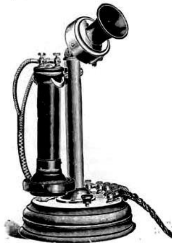
"Desk" Complete with 10000 ohm magneto for long distance lines. $13.00 .....

Is one of the neatest, cheapest and best on the market. It is equipped with our non-packing transmitter, high wound receiver, cord, and 250 ohm induction coil; it is mounted on a highly polished oak base. Complete, with push button for battery lines, without batteries,