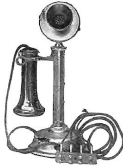
Showing Telephone Complete Price Complete, without batteries .....