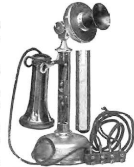
Showing Switch Connections