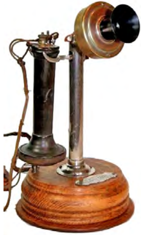
MODEL No. 11