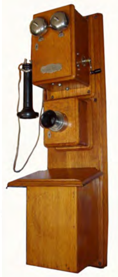
MODEL No. 21