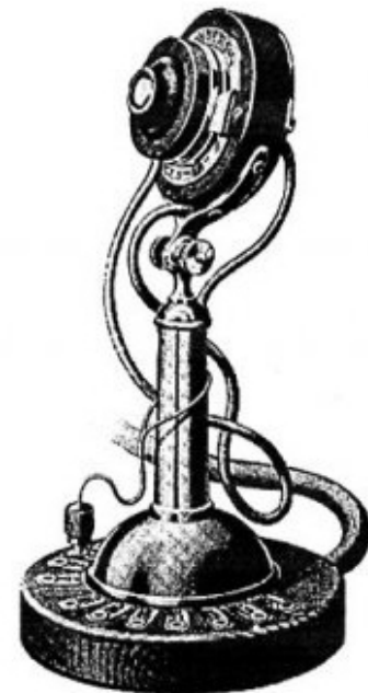
Cut No. 8.